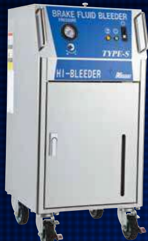
BB-1000RNS / BB-910RNS / BB-920RNS

A slim and compact stainless steel body with top and bottom integrated. The hose is made of a new material with improved brake fluid resistance.